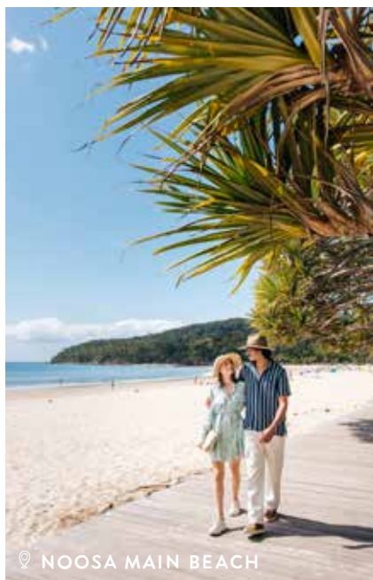
📍 NOOSA MAIN BEACH