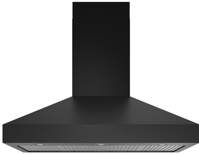
Product: 48 Inch Wall Mount, 14 Inches Tall Model Number: TRH48PB