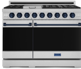
BLUE RSG48E-BLU / RSG48ELP-BLU