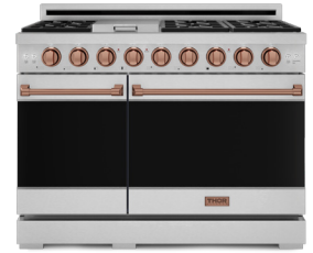
ROSE GOLD RSG48E-RSG / RSG48ELP-RSG