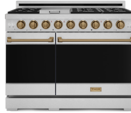
BRONZE RSG48E-BRZ / RSG48ELP-BRZ