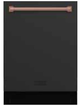
ROSE GOLD DW24X8BA00-RSG