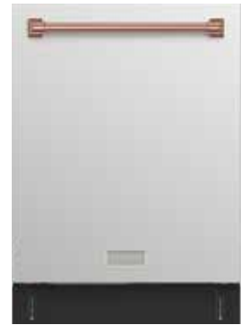
ROSE GOLD DW24X8BA99-RSG