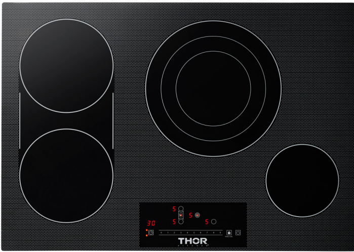
Product: 30 Inch Professional Electric Cooktop Model Number: TEC30