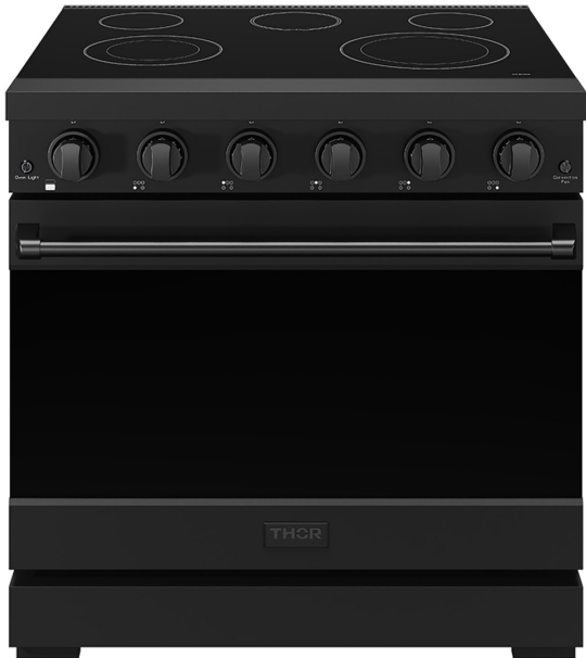
Product: 36 INCH PROFESSIONAL ELECTRIC RANGE IN BLACK Model Number: RSE36PB