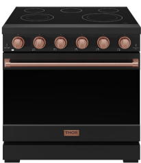
ROSE GOLD RSE36PB-RSG