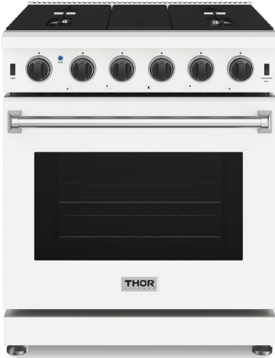
Product: 30 Inch Gas Range in White Model Number: LRG3001UW / LRG3001UWLP