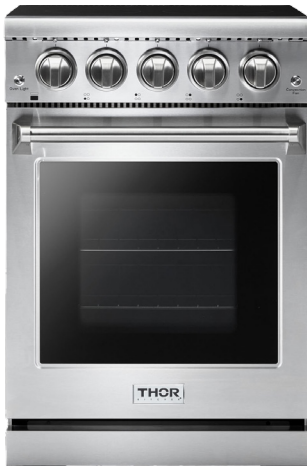
Product: 24 Inch Professional Electric Range in Stainless Steel Model Number: HRE2401