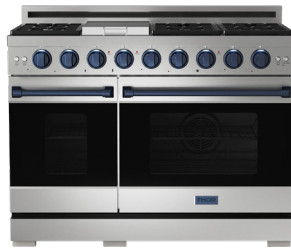
BLUE RSG48E-BLU / RSG48ELP-BLU