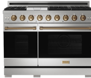
BRONZE RSG48E-BRZ / RSG48ELP-BRZ