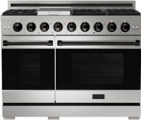
BLACK RSG48E-BLK / RSG48ELP-BLK