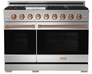
ROSE GOLD RSG48E-RSG / RSG48ELP-RSG