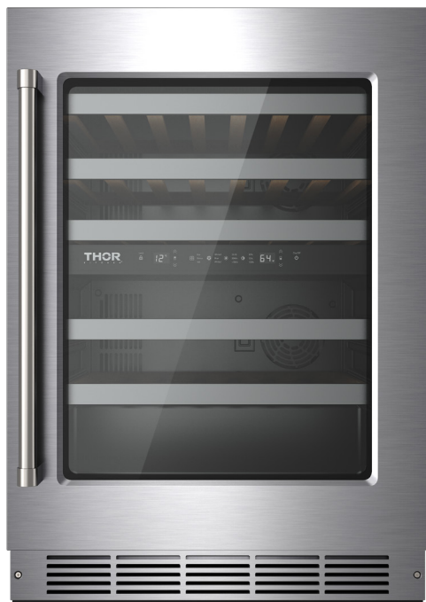
Product: 24 Inch Undercounter Dual Zone Wine Cooler Model Number: TWC24UD