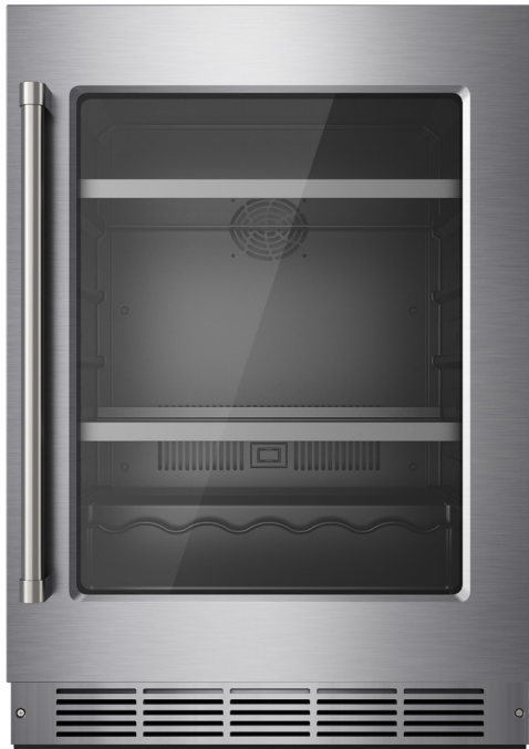
Product: 24-Inch Indoor Undercounter Beverage Cooler Model Number: TBR24US