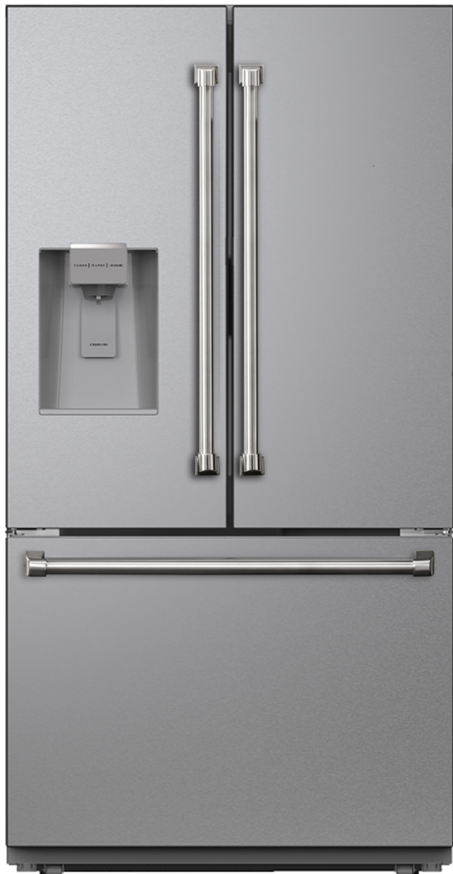
Product: 36-inch 28.9 cu.ft. 3-Door French Door Full Depth Refrigerator with Water Dispenser and Dual Ice Makers in Stainless Steel Model Number: TRF3628FFD