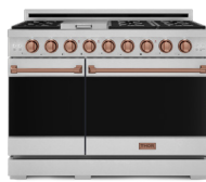
RSG48E-RSG / RSG48ELP-RSG

12,000 - 18,000 BTU Burners | Commercial Convection Fan