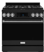
RSG36B-SS / RSG30BLP-SS