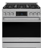
RSG36 / RSG36LP

6,000 - 18,000 BTU Burners | 650 BTU Simmer Function | True Convection Fan