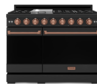
RSG48EB-RSG / RSG48EBLP-RSG