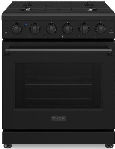
Product: 30 Inch Gas Range in Black Model Number: LRG3001UB / LRG3001UBLP