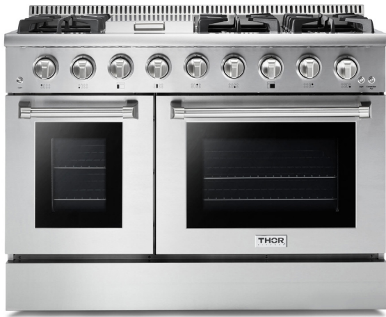
Product: 48 Inch Professional 6 Burner Gas Range in Stainless Steel Model Number: HRG4808U / HRG4808ULP