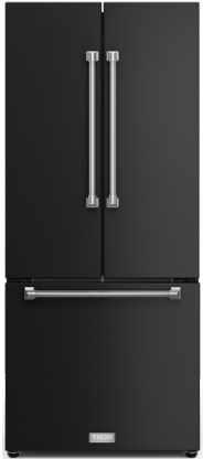
STAINLESS STEEL RF3017FFD00-SS