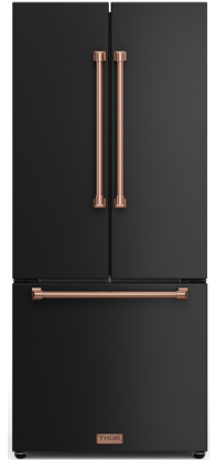
ROSE GOLD RF3017FFD00-RSG