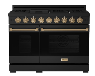
BRONZE RSG48EB-BRZ / RSG48EBLP-BRZ