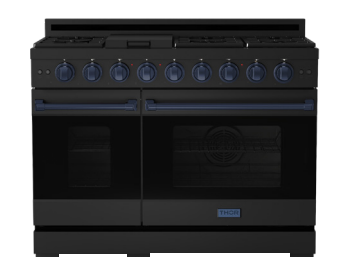
BLUE RSG48EB-BLU / RSG48EBLP-BLU