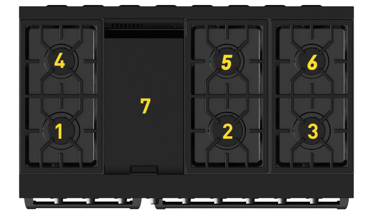
COOKTOP PERFORMANCE Total Number Of Cooktop Burners 7 (1) Front Left Burner 12,000 BTU (2) Front Center Burner 18,000 BTU (3) Front Right Burner 12,000 BTU (4) Rear Left Burner 12,000 BTU (5) Rear Center Burner 12,000 BTU (6) Rear Right Burner 12,000 BTU (7) Griddle Burner 15,000 BTU