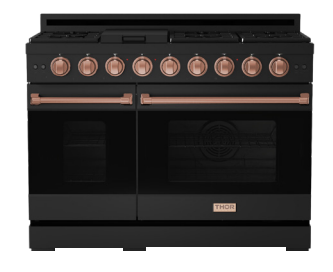
ROSE GOLD RSG48EB-RSG / RSG48EBLP-RSG