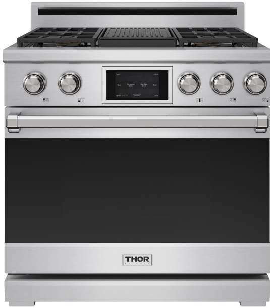
Product: 36 INCH PROFESSIONAL DUAL FUEL RANGE Model Number: XRD36E