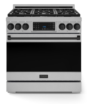
BLACK RSG36-BLK / RSG36LP-BLK