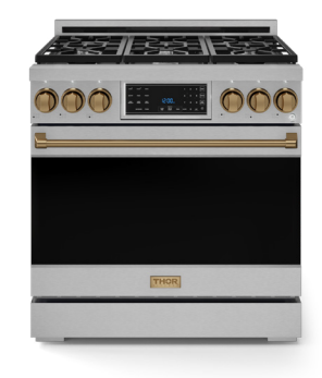
BRONZE RSG36-BRZ / RSG36LP-BRZ