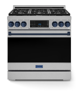
BLUE RSG36-BLU / RSG36LP-BLU