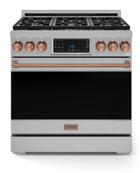
ROSE GOLD RSG36-RSG / RSG36LP-RSG