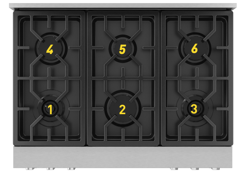
Total Number Of Cooktop Burners6[1] Front Left Burner15,000 BTU[2] Front Center Burner18,000 BTU[3] Front Right Burner15,000 BTU[4] Rear Left Burner12,000 BTU[5] Rear Center Burner6,000 BTU[6] Rear Right Burner12,000 BTU