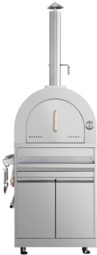
Product: Outdoor Pizza Oven and Cabinet Model Number: MK07SS304