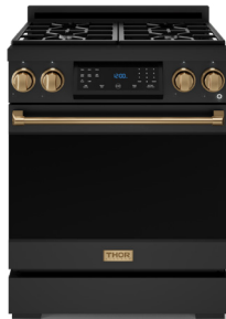
BRONZE RSG30B-BRZ / RSG30BLP-BRZ