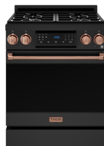
ROSE GOLD RSG30B-RSG / RSG30BLP-RSG