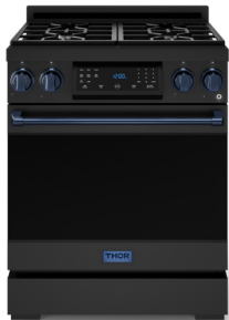
BLUE RSG30B-BLU / RSG30BLP-BLU