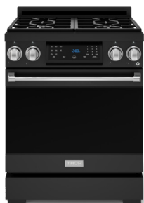
STAINLESS STEEL RSG30B-SS / RSG30BLP-SS