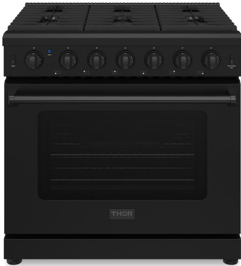
Product: 36 Inch Gas Range in Black Model Number: LRG3601UB / LRG3601UBLP