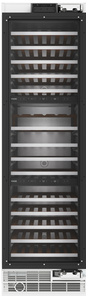
Product: 24inch Built-in Wine Cooler Model Number: XRF24CWC/ XRF24CWC-SS