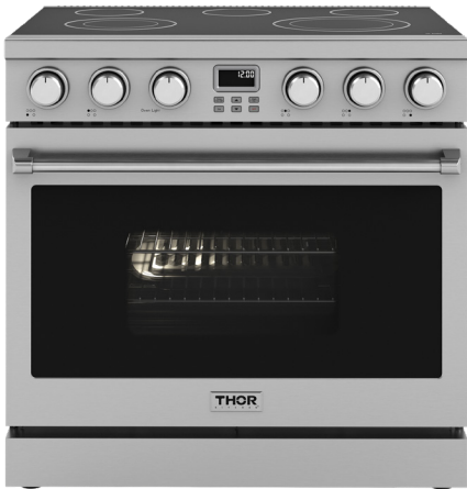
Product: 36-Inch Contemporary Professional Electric Range, Radiant Model Number: ARE36