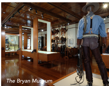
The Bryan Museum