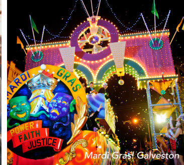
Mardi Gras! Galveston