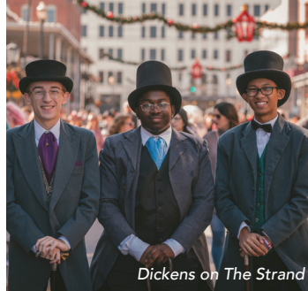
Dickens on The Strand