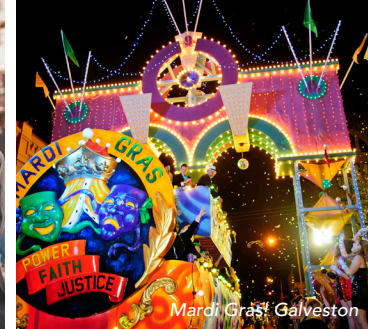
Mardi Gras! Galveston