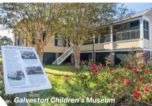
Galveston Children's Museum