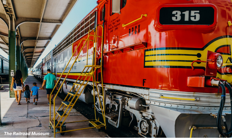
The Railroad Museum