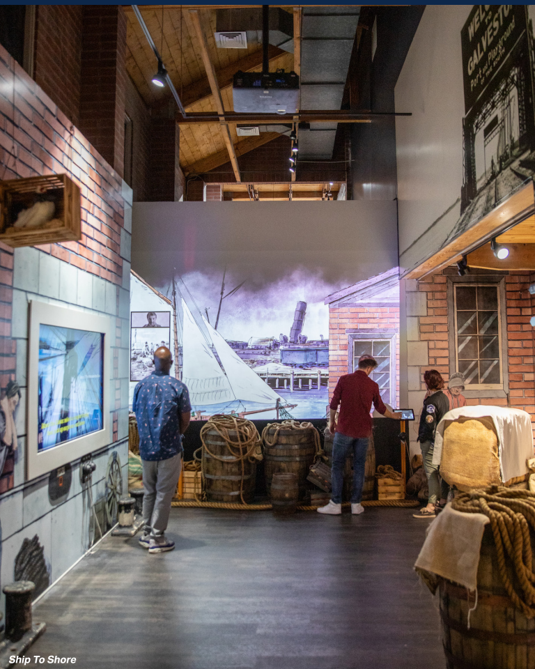
Ship To Shore

Join us Jan. 24 – 26, 2025, for Galveston Museum Weekend and celebrate the island's incredible history and unique museums. Enjoy free and discounted admission to 14 one-of-a-kind museums and attractions.