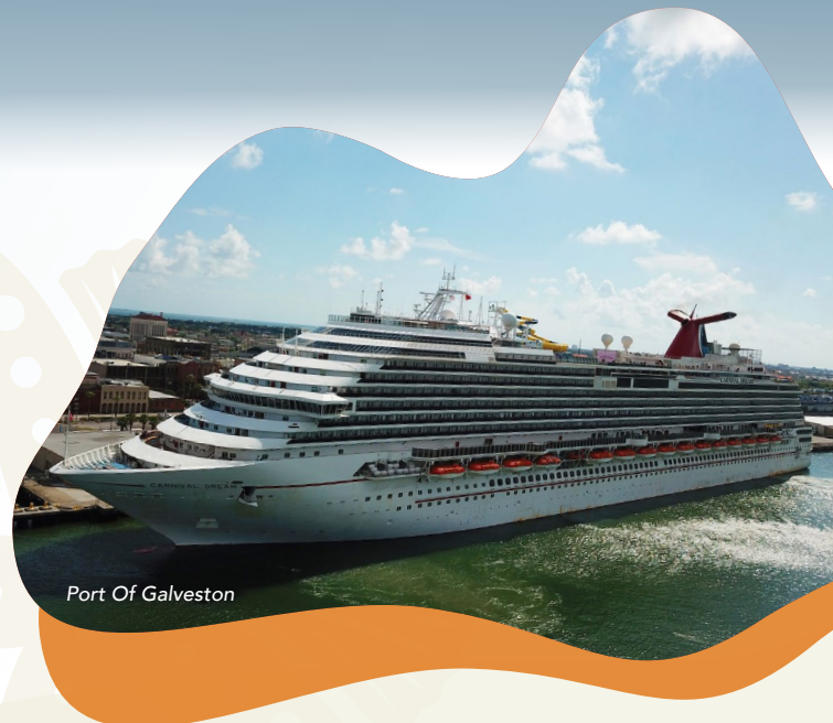
Port Of Galveston