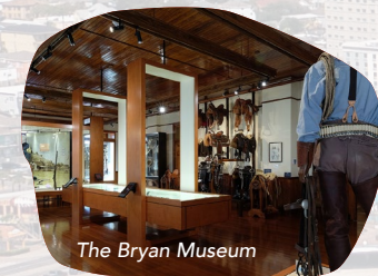
The Bryan Museum