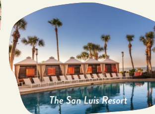
The San Luis Resort