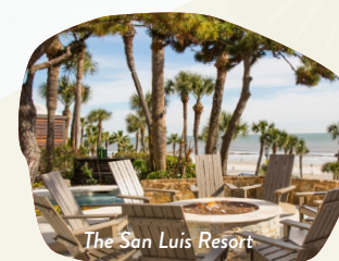
The San Luis Resort