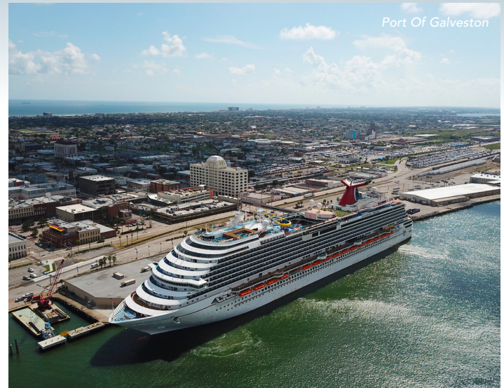
Port Of Galveston