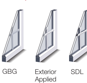
GRID | TYPE