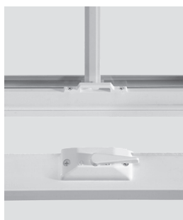
HEAVY DUTY LOCK