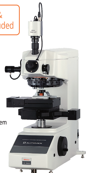
64AAB380P HM-210B Type System