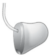
Fig.1 cShell - standard tube

We offer an alternative cShell build style with an anterior tube outlet. This build style provides high cosmetic acceptance in spite of a slightly larger size and can be used in case of build problems due to anatomical limitations. This build style is available for acrylic shells only.