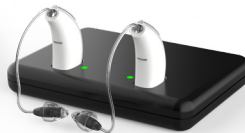
Mini Turbo Charger