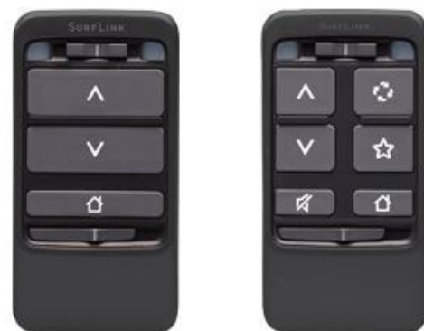
Basic (left) and Advanced (right)