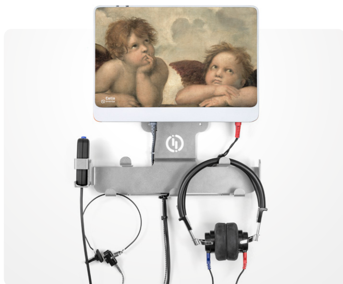
Cello on its optional wall hanger.

— Cello is a PC or iPad® controlled diagnostic audiometer, capable of performing fast and accurate air, bone and speech audiometry exams, as well as several additional tests including QuickSIN™, HF audiometry, and video-VRA. With its revolutionary design, complete feature set and top reliability, Cello is a little masterpiece, ideal for anyone unwilling to compromise on appearance and user experience.