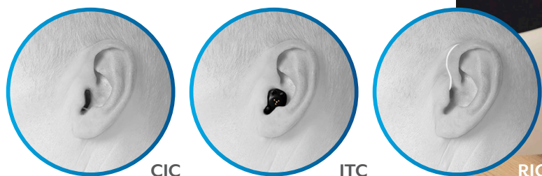
A range of styles for your patients' specific needs.

Custom craftsmanship and innovation have led to an effortless hearing experience. Patients now have a complete line of hearing aid options that fit seamlessly into their unique lifestyles. From our smallest to our most powerful, we've cracked the code for our hearing aids to be effortlessly perfect.