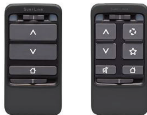
Basic (left) and Advanced (right)