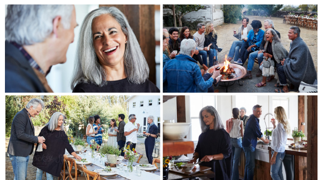
Automatically rescans as environment changes.