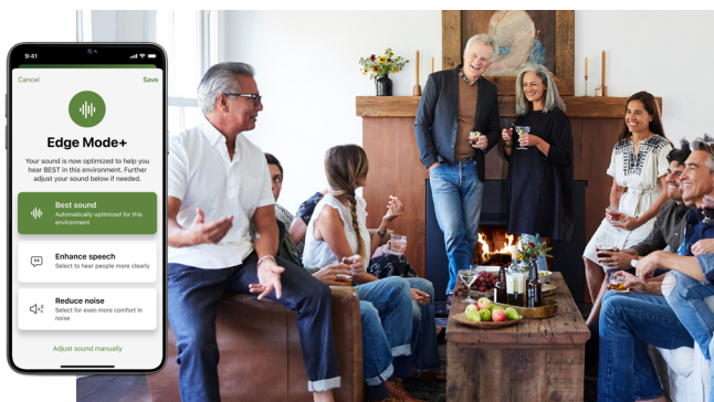
Activate Edge Mode+ then select your listening intent for further personalization.