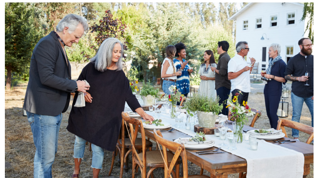
Reactivate Edge Mode+ to rescan as environment changes.