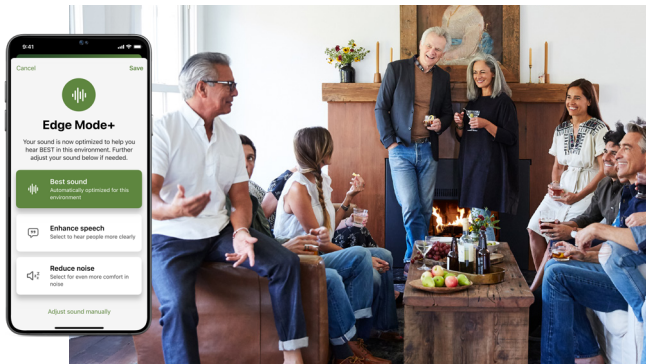
Activate Edge Mode+ then select your listening intent for further personalization.