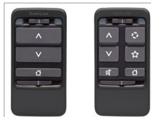
Basic (left) and Advanced (right)