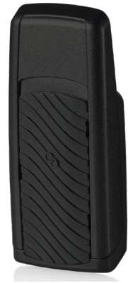
Focus (directional) Mode

NOTE: Remote Microphone will be in "Surround" mode any time it is oriented horizontally.