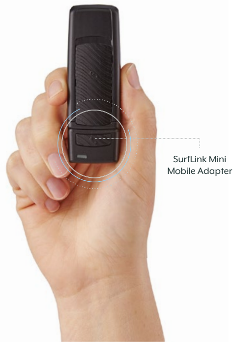
SurfLink Mini Mobile Adapter