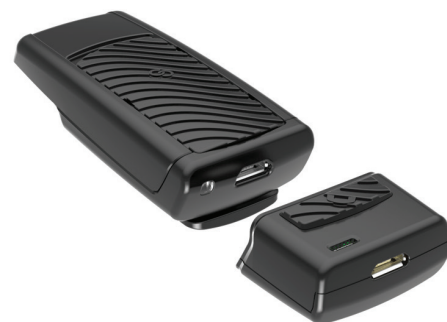
SurfLink Mini Mobile: Combination of SurfLink Remote Microphone 2 and SurfLink Mini Mobile Adapter