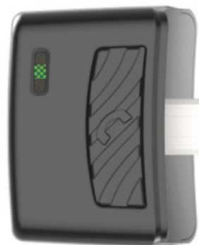
SurfLink Mini Mobile Adapter