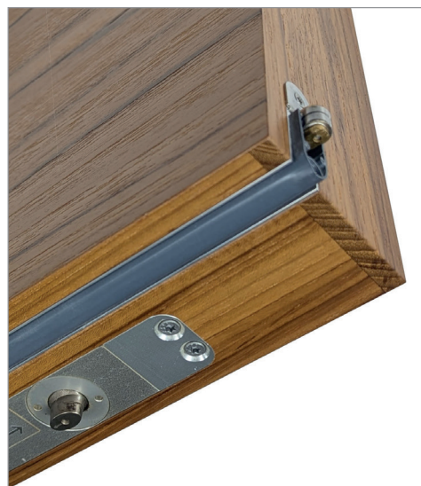
Schall-Ex® L-15/30 WS Pivot shown with FritsJurgens System M Pivot

See next page for additional information.