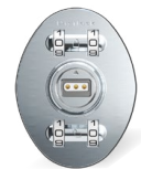
Oval surface mount with integrated pull