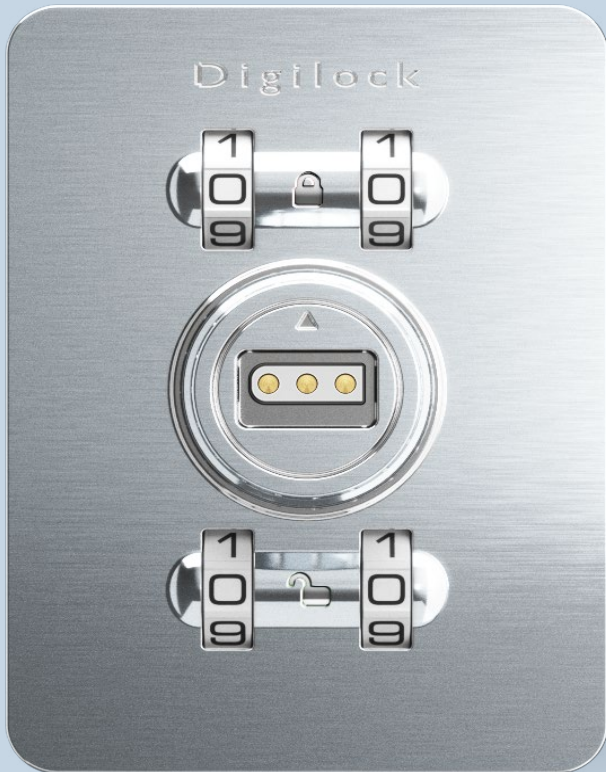
Mechanical Lock + Electronic Key