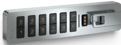
Standard Horizontal Knob on Right