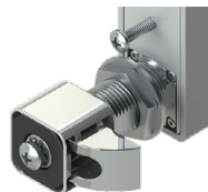
Slam Only available in assigned use