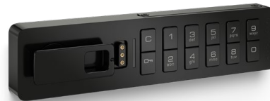
Standard Horizontal Knob on Left