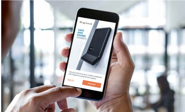
End User Smart Phone APP