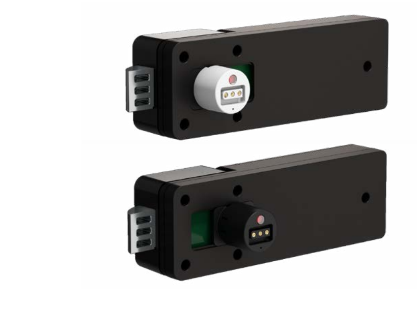
1/2" (12.7mm) Deadlatch