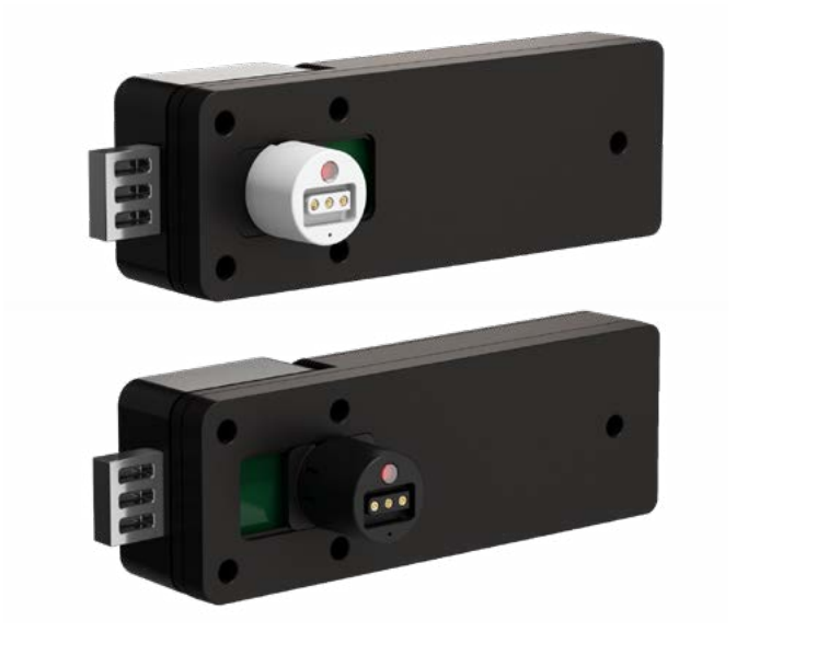
1/2" (12.7mm) Deadbolt