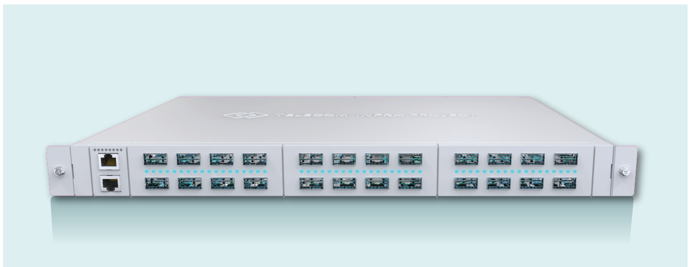
Picture: Phoenix the new disaggregated transponder/muxponder