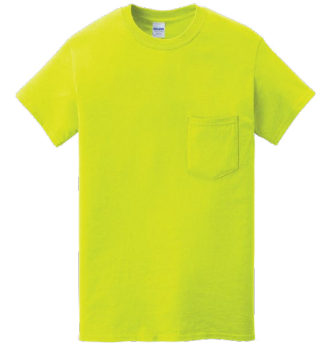
GILDAN® Heavy Cotton™ 100% Cotton Pocket T-Shirt 5300 | Adult Sizes: S-3XL