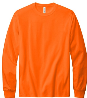
VOLUNTEER KNITWEAR™ All-American Long Sleeve Tee VL100LS | Adult Sizes: S-4XL