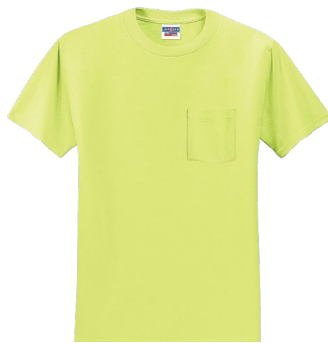
JERZEES® Dri-Power® 50/50 Cotton/ Poly T-Shirts 29M | 29B | Adult Sizes: S-5XL | Youth Sizes: XS-XL