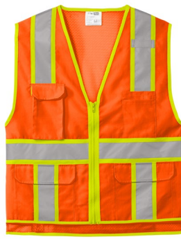
CORNERSTONE® ANSI 107 Class 2 Surveyor Zippered Two-Tone Vest CSV105 | Adult Sizes: S/M, L/XL, 2XL/3XL, 4XL/5XL