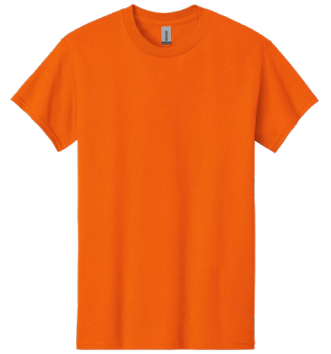
GILDAN® Heavy Cotton™ 100% Cotton T-Shirt 5000 | 5000B | Adult Sizes: S-3XL | Youth Sizes: XS-XL