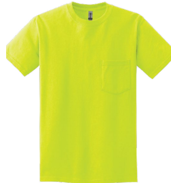
GILDAN® Ultra Cotton® 100% US Cotton T-Shirt with Pocket 2300 | Adult Sizes: S-5XL