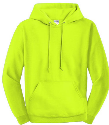
JERZEES® Super Sweats® NuBlend® Pullover Hooded Sweatshirt 4997M | Adult Sizes: S-3XL