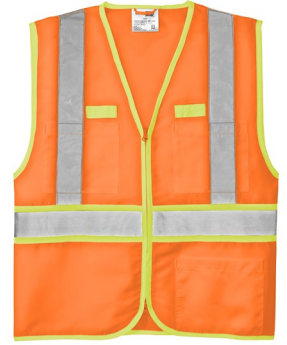
CORNERSTONE® ANSI 107 Class 2 Dual-Color Safety Vest CSV407 | Adult Sizes: S-4XL