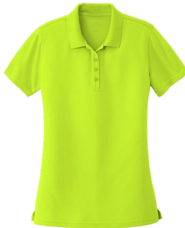
PORT AUTHORITY® Ladies Dry Zone® UV Micro-Mesh Polo LK110 | Adult Sizes: XS-4XL