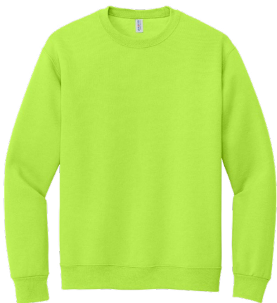
JERZEES® Super Sweats® NuBlend® Crewneck Sweatshirt 4662M | Adult Sizes: S-3XL