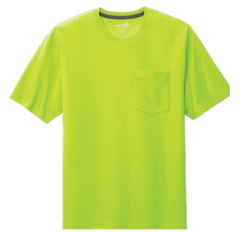
CORNERSTONE® Workwear Pocket Tee CS430 | Adult Sizes: S-4XL