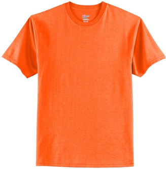
HANES® Authentic 100% Cotton T-Shirt 5250 | Adult Sizes: S-5XL