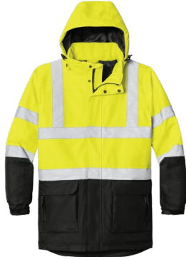
PORT AUTHORITY ANSI 107 Class 3 Safety Heavyweight Parka J799S | Adult Sizes: XS-4XL