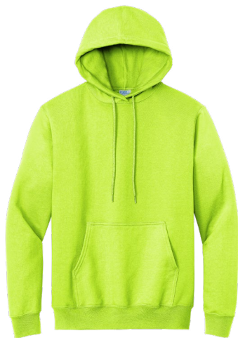
PORT & COMPANY® Essential Fleece Pullover Hooded Sweatshirts PC90H | PC90HT | Adult Sizes: S-4XL Tall Sizes: LT-4XLT