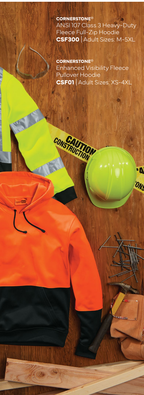
CORNERSTONE® ANSI 107 Class 3 Heavy-Duty Fleece Full-Zip Hoodie CSF300 | Adult Sizes: M-5XL