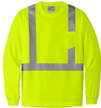
CORNERSTONE® ANSI 107 Class 2 Mesh Long Sleeve Tee CS201 | Adult Sizes: S-5XL