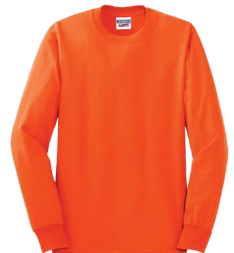
JERZEES® Dri-Power® 50/50 Cotton/ Poly Long Sleeve T-Shirt 29LS | Adult Sizes: S-3XL