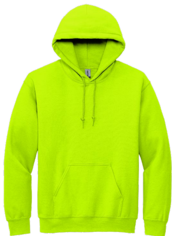
GILDAN® DryBlend® Pullover Hooded Sweatshirt 12500 | Adult Sizes: S-3XL