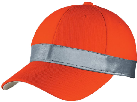
CORNERSTONE® ANSI 107 Safety Cap CS802