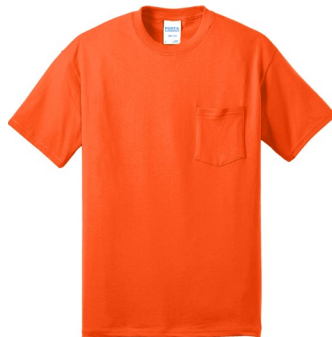
PORT & COMPANY® Core Blend Pocket Tees PC55P | PC55PT Adult Sizes: S-6XL | Tall Sizes LT-4XLT