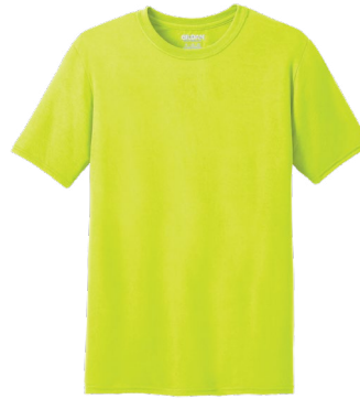
GILDAN Performance® T-Shirt 42000 | Adult Sizes: S-3XL