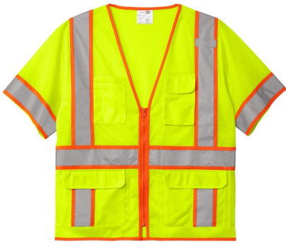
CORNERSTONE® ANSI 107 Class 3 Surveyor Mesh Zippered Two-Tone Short Sleeve Vest CSV106 | Adult Sizes: M-5XL