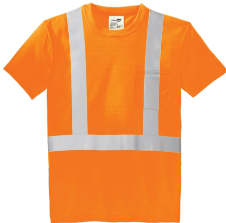
CORNERSTONE® ANSI 107 Class 2 Safety T-Shirt CS401 | Adult Sizes: XS-4XL