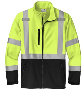
CORNERSTONE® ANSI 107 Class 3 Soft Shell Jacket CSJ503 | Adult Sizes: S-5XL