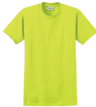
GILDAN® Ultra Cotton® 100% US Cotton T-Shirts 2000 | 2000T | 2000B | Adult Sizes: S-5XL | Tall Sizes: LT-3XLT | Youth Sizes: XS-XL