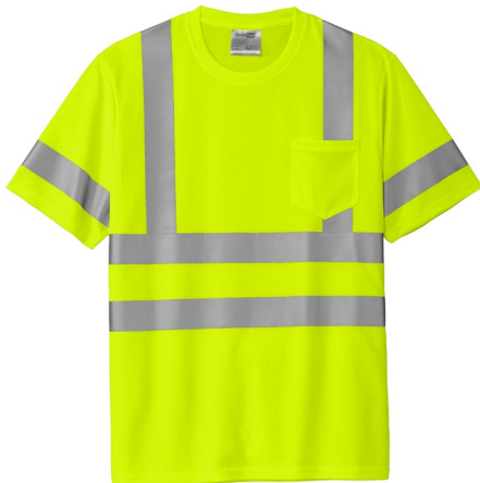
CORNERSTONE® ANSI 107 Class 3 Mesh Tee CS202 | Adult Sizes: M-5XL