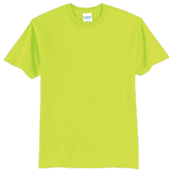
PORT & COMPANY® Core Blend Tee PC55 | PC55T | PC55Y | Adult Sizes: S-6XL | Tall Sizes: LT-4XLT | Youth Sizes: XS-XL