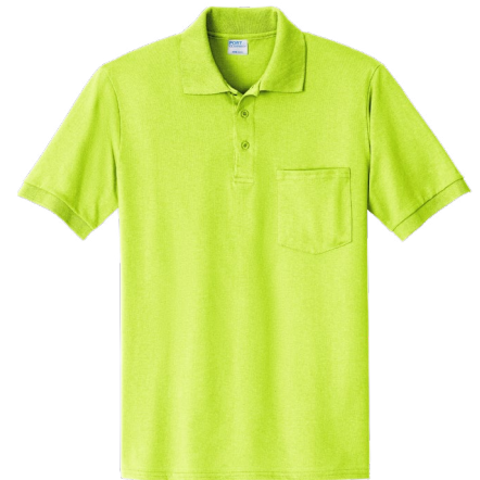
PORT & COMPANY® Core Blend Jersey Knit Polos KP55 | KP55T | Adult Sizes: XS-6XL Tall Sizes: LT-4XLT