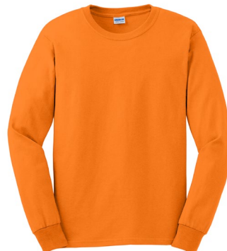
GILDAN® Ultra Cotton® 100% US Cotton Long Sleeve T-Shirt G2400 | Adult Sizes: S-5XL