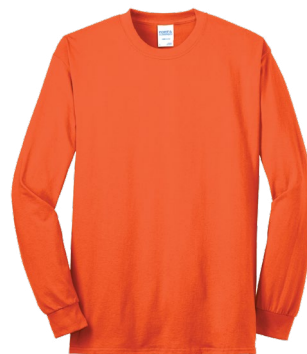
PORT & COMPANY® Long Sleeve Core Blend Tees PC55LS | PC55LST | Adult Sizes: S-6XL | Tall Sizes: LT-4XLT