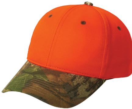
PORT AUTHORITY® Enhanced Visibility Cap with Camo Brim C804