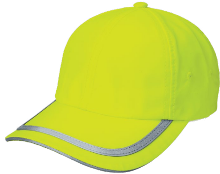
PORT AUTHORITY® Enhanced Visibility Cap C836