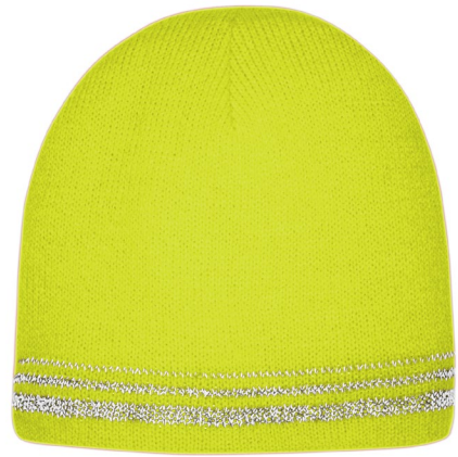
CORNERSTONE® Lined Enhanced Visibility with Reflective Stripes Beanie CS804