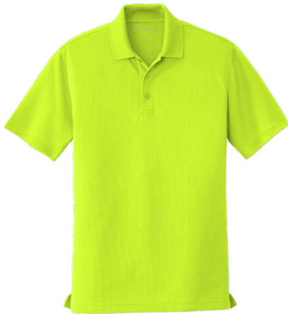
PORT AUTHORITY® Dry Zone® UV Micro-Mesh Polo KT10 | Adult Sizes: XS-6XL