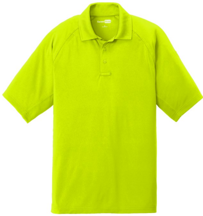
CORNERSTONE® Select Lightweight Snag-Proof Tactical Polo CS420 | Adult Sizes: XS-4XL