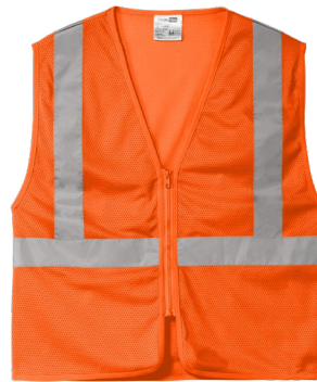
CORNERSTONE® ANSI 107 Class 2 Economy Mesh Zippered Vest CSV101 | Adult Sizes: S/M, L/XL, 2XL/3XL, 4XL/5XL