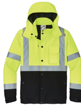
CORNERSTONE® ANSI 107 Class 3 Waterproof Insulated Ripstop Bomber Jacket CSJ501 | Adult Sizes: S-5XL