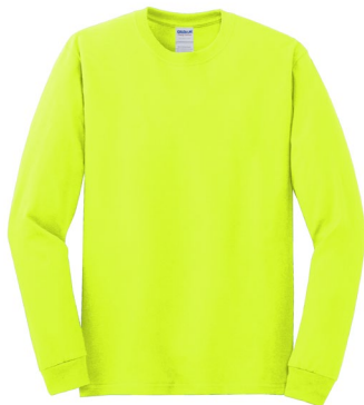
GILDAN® Heavy Cotton™ 100% Cotton Long Sleeve T-Shirt 5400 | Adult Sizes: S-3XL