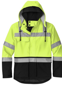
CORNERSTONE® ANSI 107 Class 3 Waterproof Ripstop 3-in-1 Parka CSJ502 | Adult Sizes: S-5XL