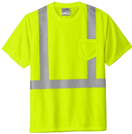
CORNERSTONE® ANSI 107 Class 2 Mesh Tee CS200 | Adult Sizes: S-5XL