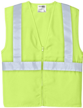
CORNERSTONE® ANSI 107 Class 2 Safety Vest CSV400 | Adult Sizes: S/M, L/ XL, 2XL/3XL