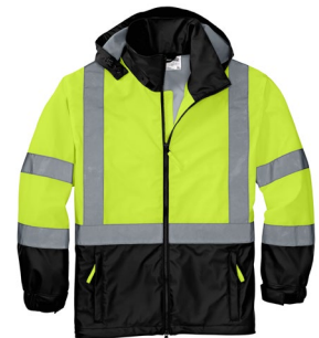
CORNERSTONE® ANSI 107 Class 3 Safety Windbreaker CSJ25 | Adult Sizes: S-4XL