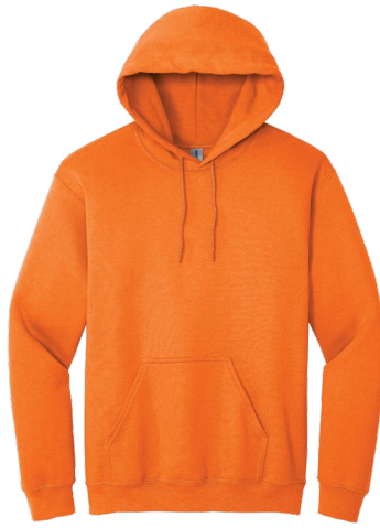
GILDAN® Heavy Blend™ Hooded Sweatshirt 18500 | Adult Sizes: S-5XL