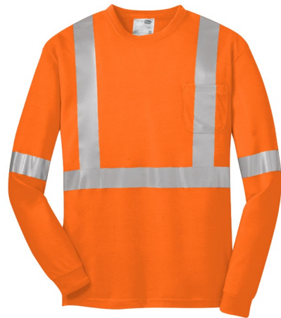
CORNERSTONE® ANSI 107 Class 2 Long Sleeve Safety T-Shirt CS401LS | Adult Sizes: XS-4XL