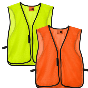
CORNERSTONE® Enhanced Visibility Mesh Vest CSV01 | One Size Fits Most