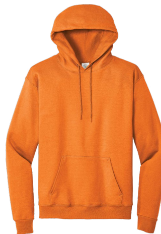
HANES® EcoSmart® Pullover Hooded Sweatshirt P170 | Adult Sizes: S-5XL