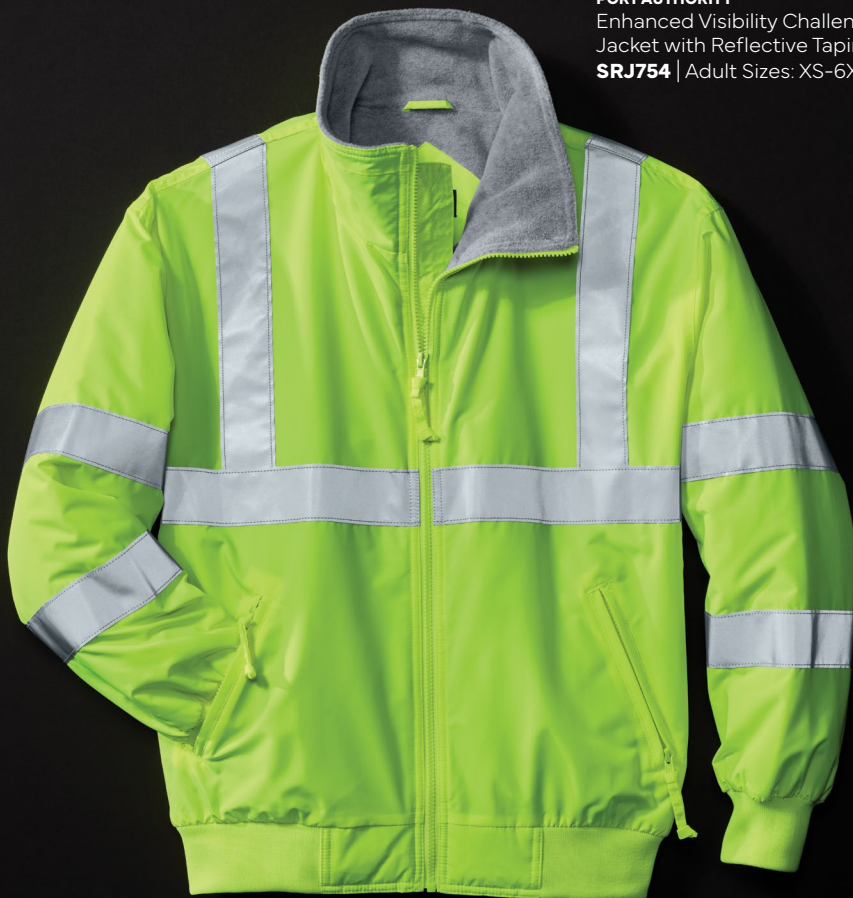
PORT AUTHORITY® Enhanced Visibility Challenger™ Jacket with Reflective Taping SRJ754 | Adult Sizes: XS-6XL