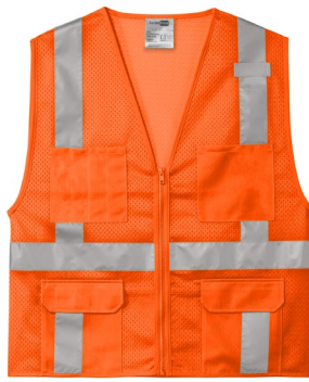
CORNERSTONE® ANSI 107 Class 2 Mesh Six- Pocket Zippered Vest CSV104 | Adult Sizes: S/M, L/XL, 2XL/3XL, 4XL/5XL