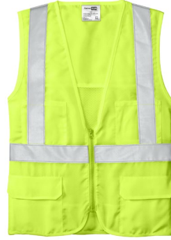
CORNERSTONE® ANSI 107 Class 2 Mesh Back Safety Vest CSV405 | Adult Sizes: S-4XL