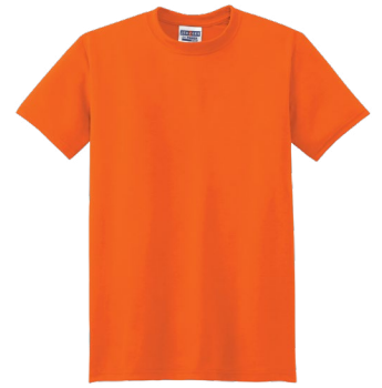
JERZEES® Dri-Power® 100% Polyester T-Shirt 21M | Adult Sizes: S-3XL