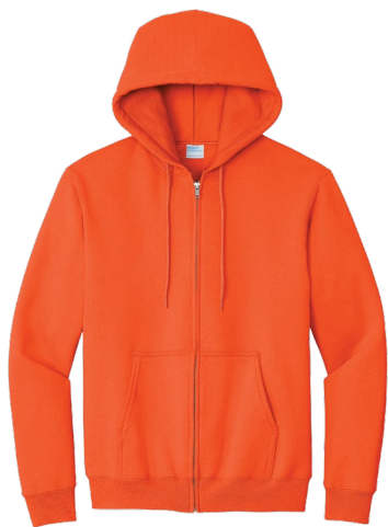
PORT & COMPANY® Essential Fleece Full-Zip Hooded Sweatshirts PC90ZH | PC90ZHT | Adult Sizes: S-4XL Tall Sizes: LT-4XLT