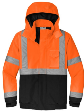
CORNERSTONE® ANSI 107 Class 3 Economy Waterproof Insulated Bomber Jacket CSJ500 | Adult Sizes: S-5XL