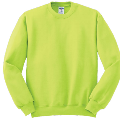
JERZEES® NuBlend® Crewneck Sweatshirt 562M | Adult Sizes: S-4XL