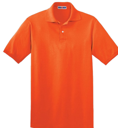
JERZEES® SpotShield™ 5.4-Ounce Jersey Knit Sport Shirt 437M | Adult Sizes: S-4XL