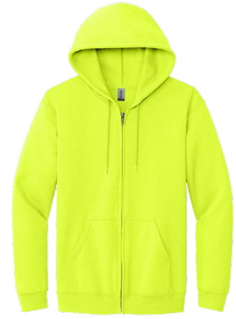
GILDAN® Heavy Blend™ Full-Zip Hooded Sweatshirt 18600 | Adult Sizes: S-5XL