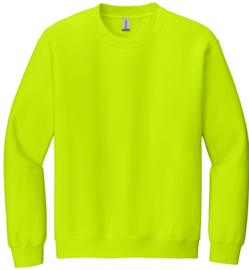
GILDAN® Heavy Blend™ Crewneck Sweatshirt 18000 | Adult Sizes: S-5XL