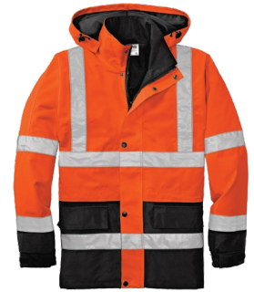
CORNERSTONE® ANSI 107 Class 3 Waterproof Parka CSJ24 | Adult Sizes: S-4XL