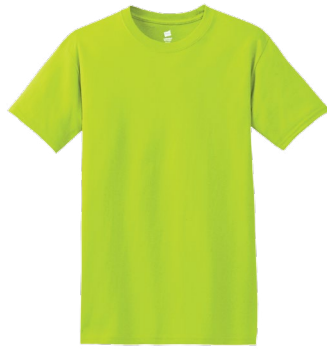
HANES® Essential-T 100% Cotton T-Shirt 5280 | Adult Sizes: S-3XL