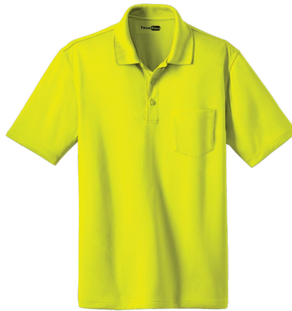
CORNERSTONE® Select Snag-Proof Pocket Polo CS412P | Adult Sizes: XS-4XL