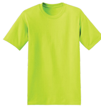
HANES® EcoSmart® 50/50 Cotton/Poly T-Shirt 5170 | Adult Sizes: S-4XL