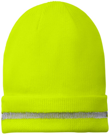
CORNERSTONE® Enhanced Visibility Beanie with Reflective Stripe CS800