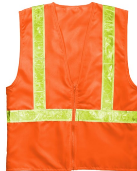
PORT AUTHORITY Enhanced Visibility Vest SV01 | Adult Sizes: S/M, L/XL, 2XL/3XL