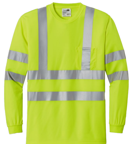
CORNERSTONE® ANSI 107 Class 3 Long Sleeve Snag-Resistant Reflective T-Shirt CS409 | Adult Sizes: XS-4XL