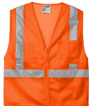
CORNERSTONE® ANSI 107 Class 2 Mesh Zippered Vest CSV102 | Adult Sizes: S/M, L/XL, 2XL/3XL, 4XL/5XL