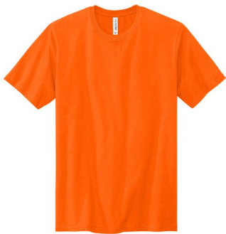
HANES® Cool Dri® Performance T-Shirt 4820 | Adult Sizes: XS-3XL