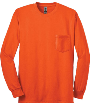
GILDAN® Ultra Cotton® 100% US Cotton Long Sleeve T-Shirt with Pocket 2410 | Adult Sizes: S-5XL