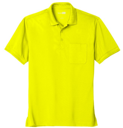
CORNERSTONE® Industrial Snag-Proof Pique Pocket Polo CS4020P | Adult Sizes: XS-6XL