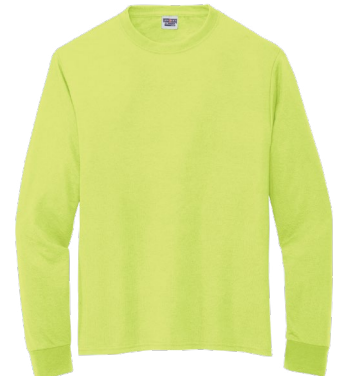
JERZEES® Dri-Power® 100% Polyester Long Sleeve T-Shirt 21LS | Adult Sizes: S-3XL