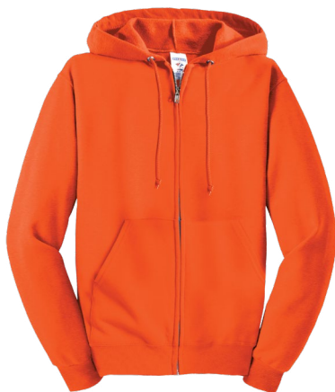
JERZEES® NuBlend® Full-Zip Hooded Sweatshirt 993M | Adult Sizes: S-3XL