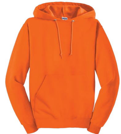
JERZEES® NuBlend® Pullover Hooded Sweatshirt 996M | Adult Sizes: S-4XL